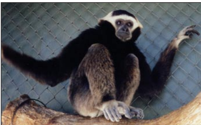
Figure 58. Hylobates pileatus (pileated gibbon) 5 year 7 month old male “Mateas Binti”, GCC.