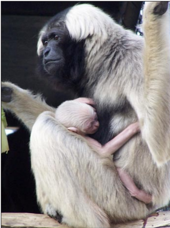
Figure 54. Hylobates pileatus (pileated gibbon) adult female “JR”, 1 day old female “Jitka”, GCC.