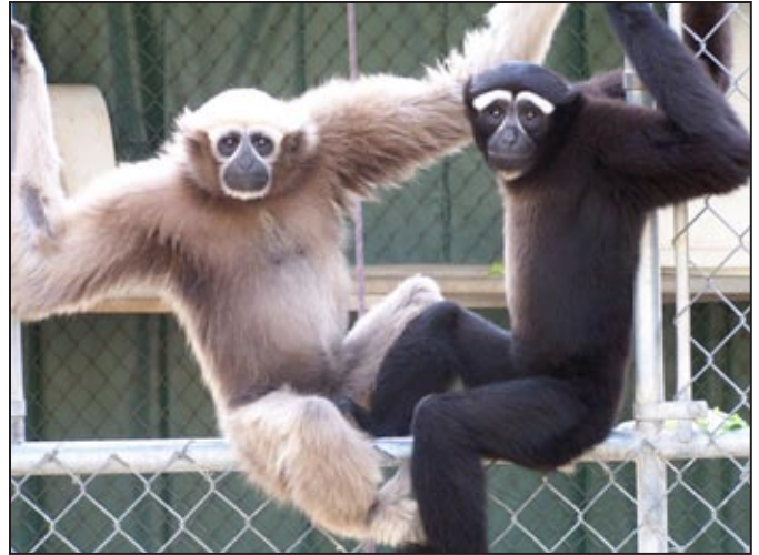
Figure 43. Hoolock leuconedys (eastern hoolock) adult male “Arthur” and adult female “Betty”, GCC.