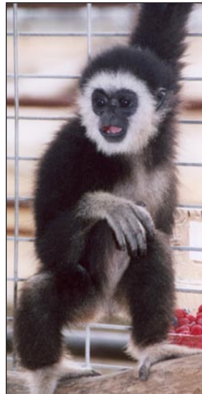
Figure 77. Hylobates lar (lar gibbon) (brown color phase) 15 month old female “Princess”, Cleveland Amory’s Black Beauty Ranch.