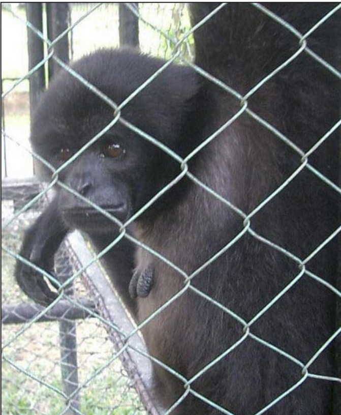
Figure 50. Hylobates klossii (Kloss' gibbon) 8 yr old female "Nanam", Gibbon Foundation, Indonesia.