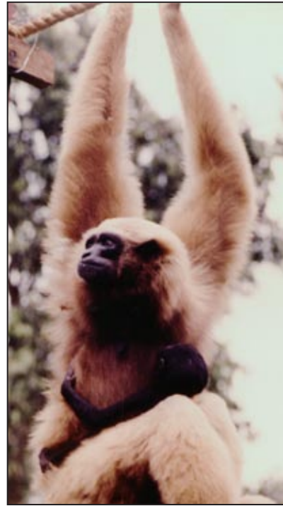
Figure 68. Hylobates agilis (agile gibbon) adult female and infant, Singapore Zoo.