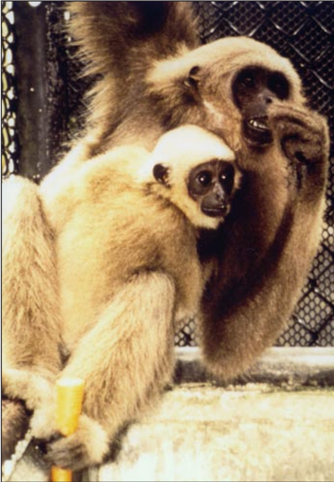
Figure 66. Hylobates muelleri abbotti (Abbott's Müller's gibbon) adult female and infant, Singapore Zoo.