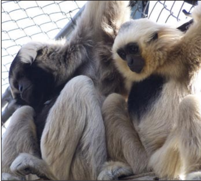
Figure 53. Hylobates pileatus (pileated gibbon) adult female “JR” in first trimester, 23 month old male “Truman”, GCC.