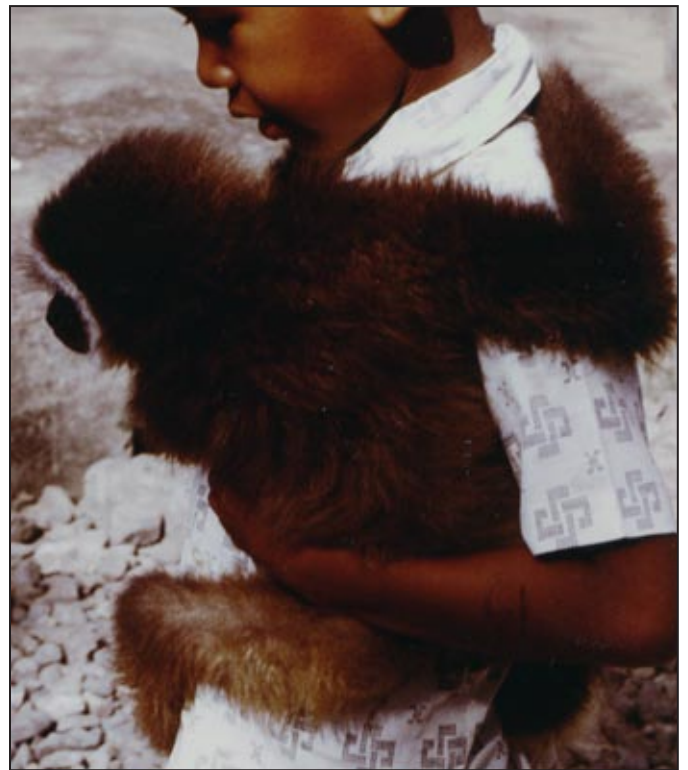
Figure 80. Hylobates lar vestitus (Sumatran lar gibbon) juvenile, Tapaktuan, Indonesia.