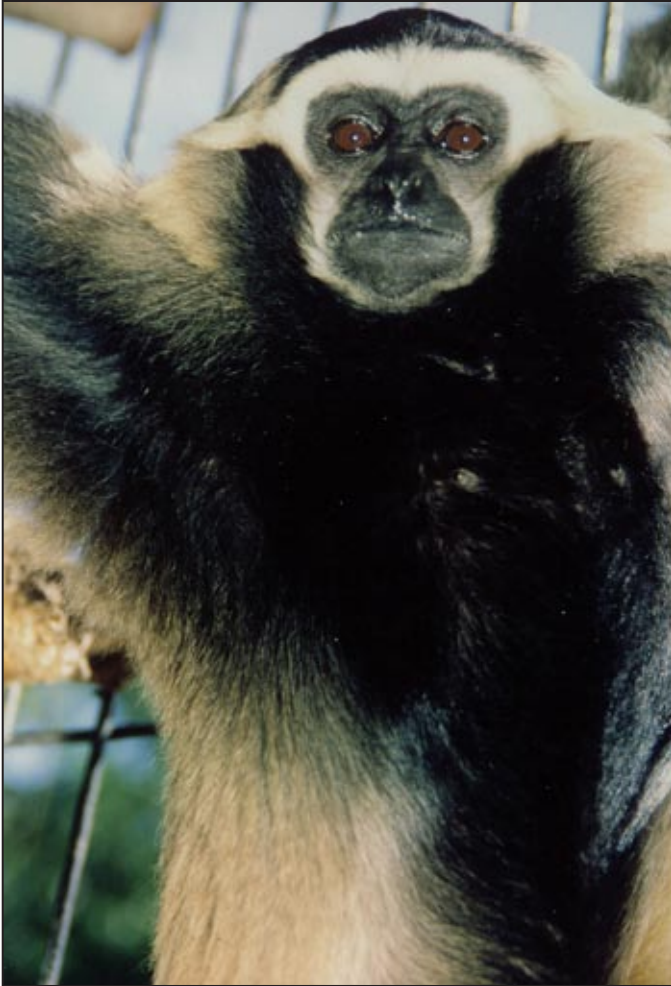
Figure 57. Hylobates pileatus (pileated gibbon) 4 yr 6 mo male “Kokopelli”, GCC.