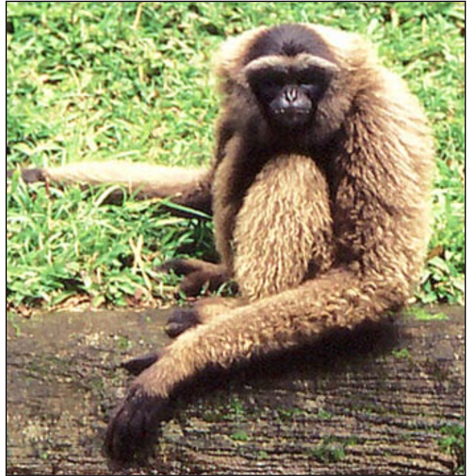
Figure 64. Hylobates m. muelleri (eastern Müller's gibbon) subadult male, Taman Safari, Indonesia.