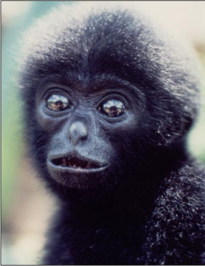
Figure 49. Hylobates klossii (Kloss' gibbon) infant, South Pagai.