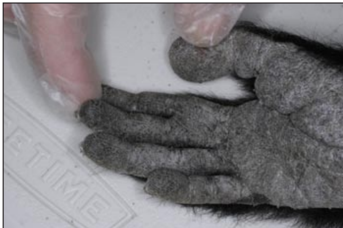
Figure 71. Hylobates a. agilis (mountain agile gibbon) adult male “Bebopen Baby”, GCC.