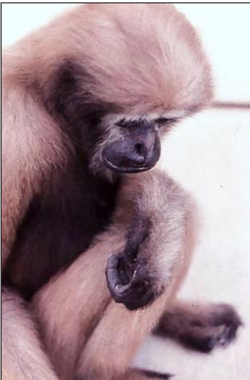
Figure 42. Hoolock hoolock (western hoolock) adult female “Alfa”, GCC.