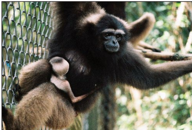
Figure 63. Hylobates m. muelleri (eastern Müller's gibbon) adult female “Dongkey”, 1.5 month old infant, Kalaweit.