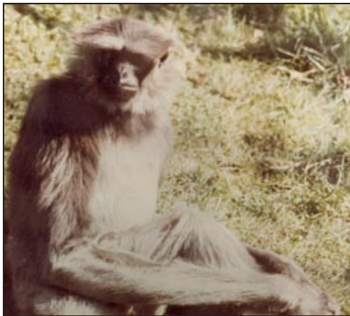
Figure 67. Hylobates muelleri abbotti (Abbott's Müller's gibbon) adult male "Hylo", Edinburgh Zoo, Great Britain.