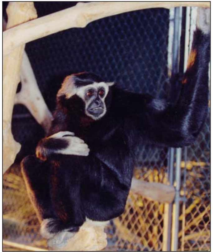
Figure 51. Hylobates pileatus (pileated gibbon) adult male "Birute", GCC.