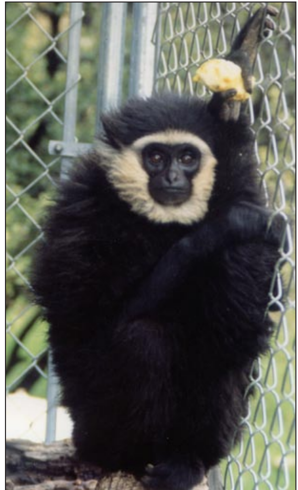
Figure 69. Hylobates a. agilis (mountain agile gibbon) juvenile female "Ruby Baby", GCC.