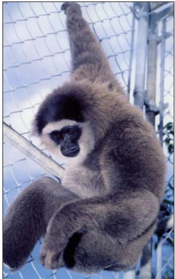
Figure 60. Hylobates moloch (Javan gibbon) adult male “Chilibi”, GCC.