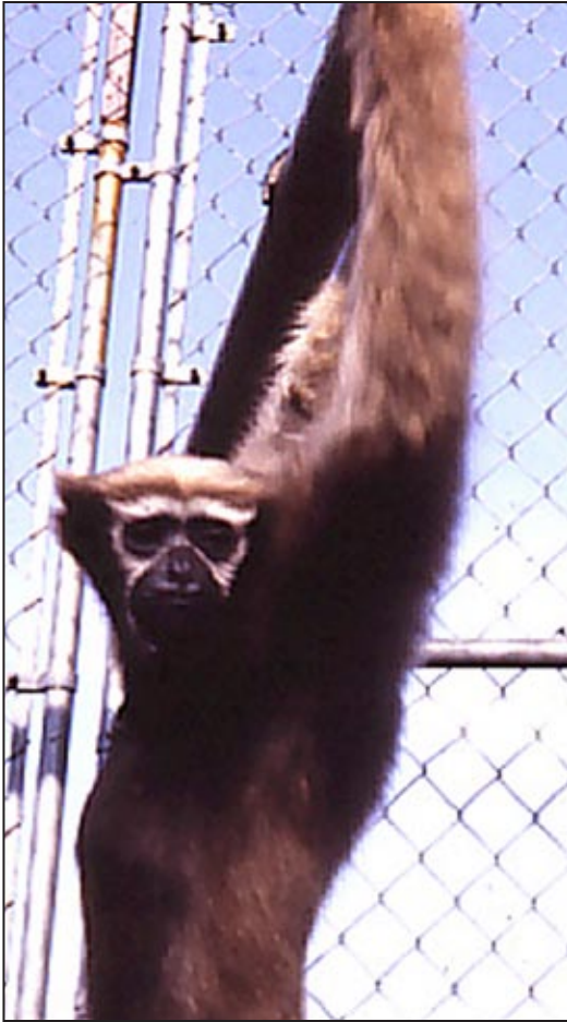
Figure 41. Hoolock hoolock (western hoolock) adult female “Alfa”,GCC.