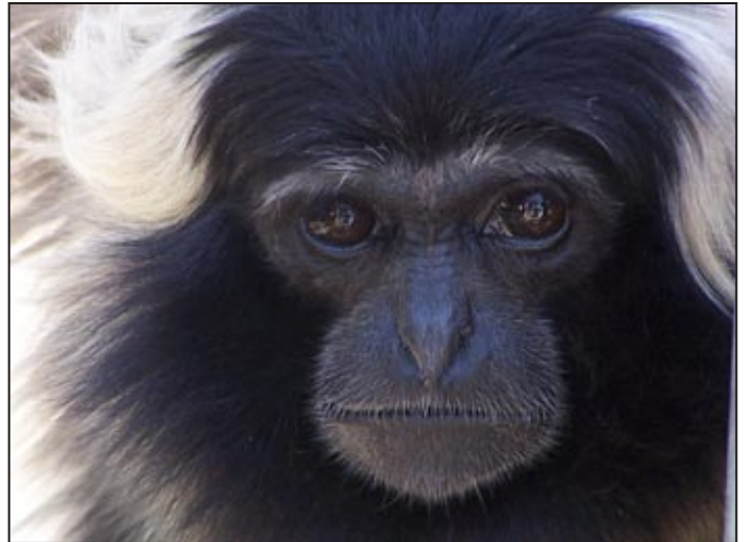
Figure 55. Hylobates pileatus (pileated gibbon) adult female “Tuk”, GCC.