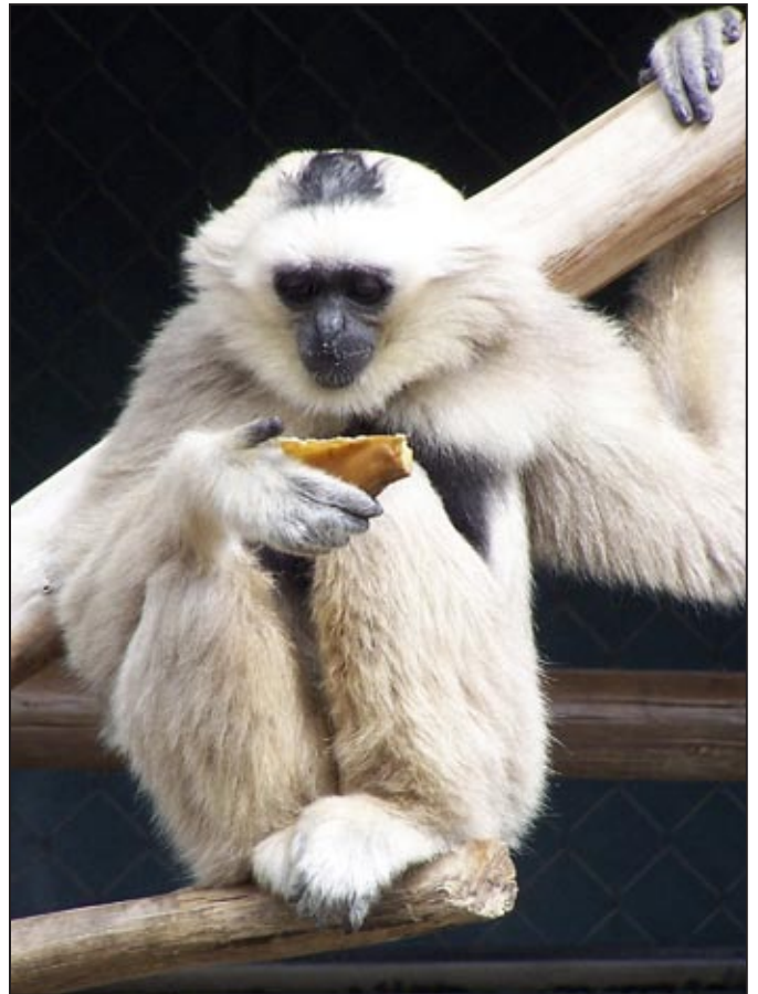
Figure 56. Hylobates pileatus (pileated gibbon) adult female “JR”, 32 month old male “Truman”, GCC.