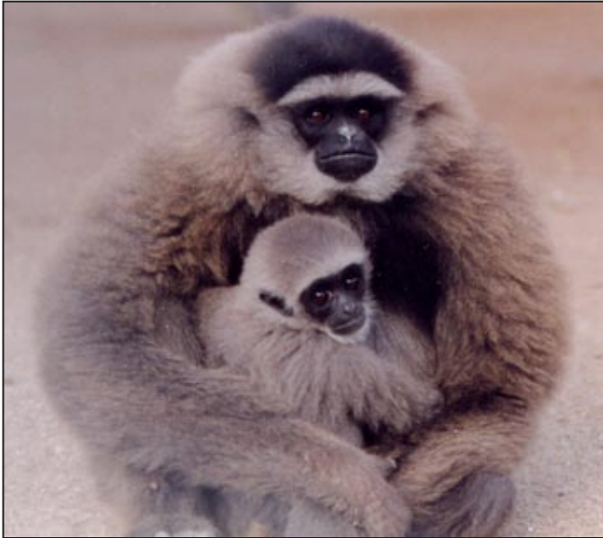
Figure 61. Hylobates moloch (Javan gibbon) adult female “Chloe”, 6 month old male “Reg”, GCC.