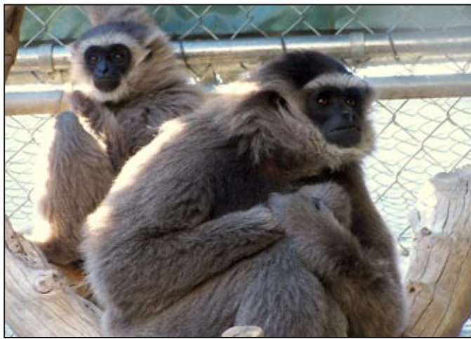
Figure 62. Hylobates moloch (Javan gibbon) 3 yr old male “Lionel”, 6 year 10 month old male “Isaac”, GCC.