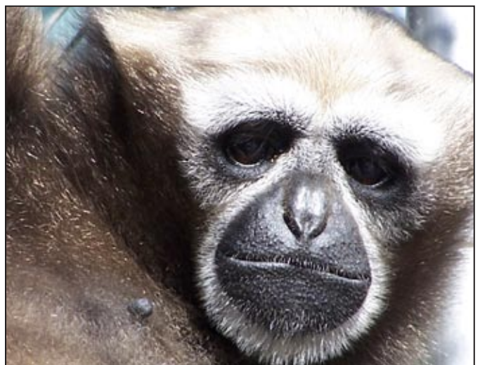
Figure 45. Hoolock leuconedys (eastern hoolock) adult female “Drew”, GCC.