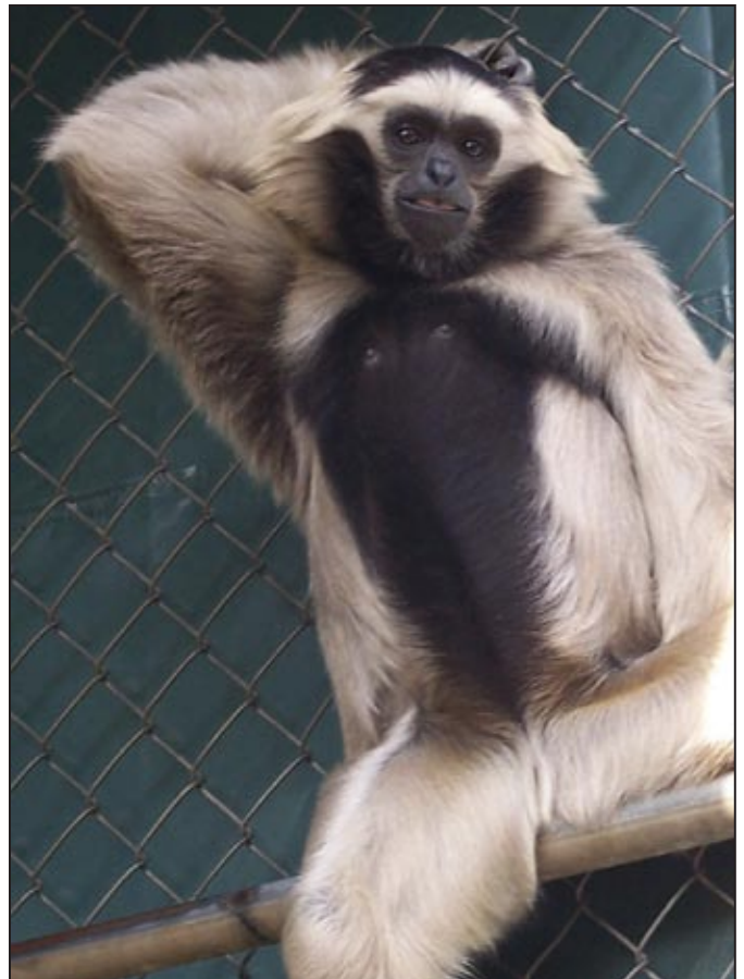
Figure 52. Hylobates pileatus (pileated gibbon) 52 month old female "Kana-ko", GCC.