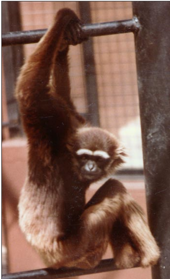
Figure 75. Hylobates albibarbis (white-bearded gibbon) adult female “Jackie”, Valley Zoo, Canada.