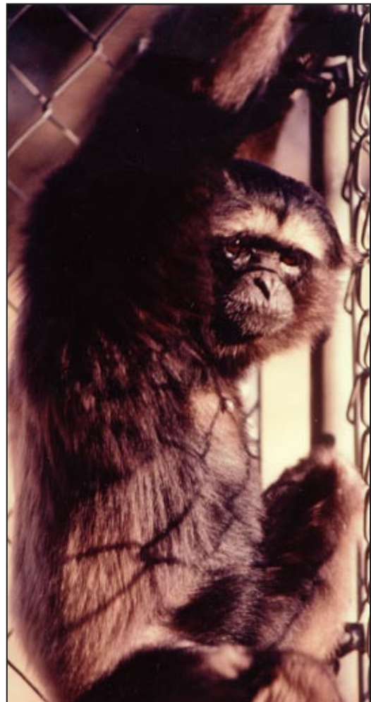
Figure 65. Hylobates muelleri funereus (northern Müller's gibbon) adult female “Abbey”, GCC.