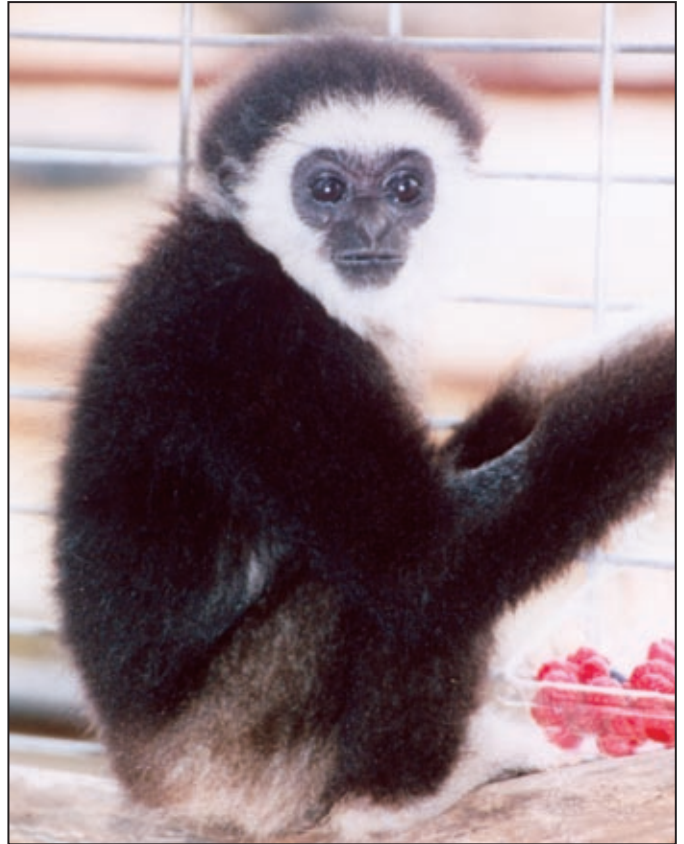
Figure 76. Hylobates lar (lar gibbon) (brown color phase) 15 month old female “Princess”, Cleveland Amory’s Black Beauty Ranch, Texas.