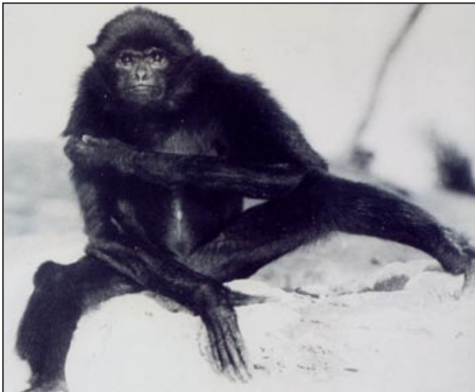
Figure 47. Hylobates klossii (Kloss' gibbon) adult female, Lion County Safari, California.