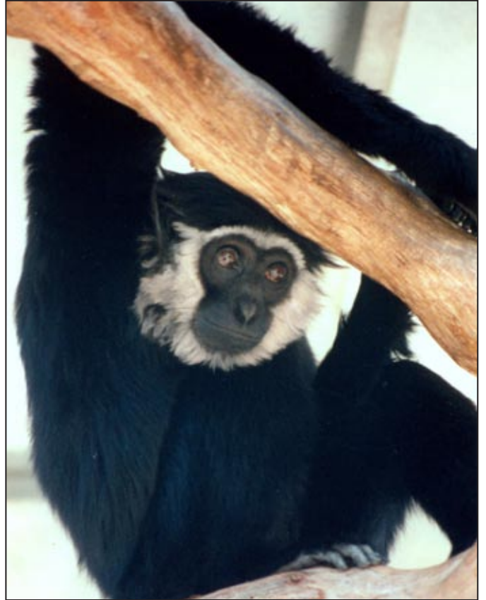
Figure 72. Hylobates a. agilis (mountain agile gibbon) adult male “Sonny”, GCC.