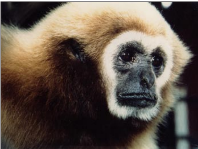
Figure 79. Hylobates lar entelloides (Thai lar gibbon) (born in northeast Thailand) adult female “Judy”, GCC.