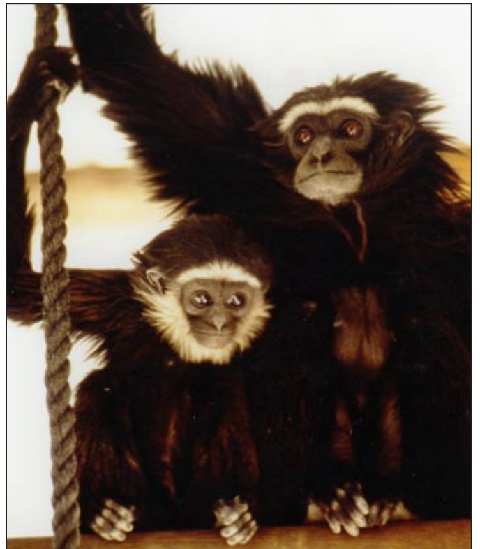
Figure 73. Hylobates a. agilis (mountain agile gibbon) adult female “Mumma” and infant male “Albert”, GCC.