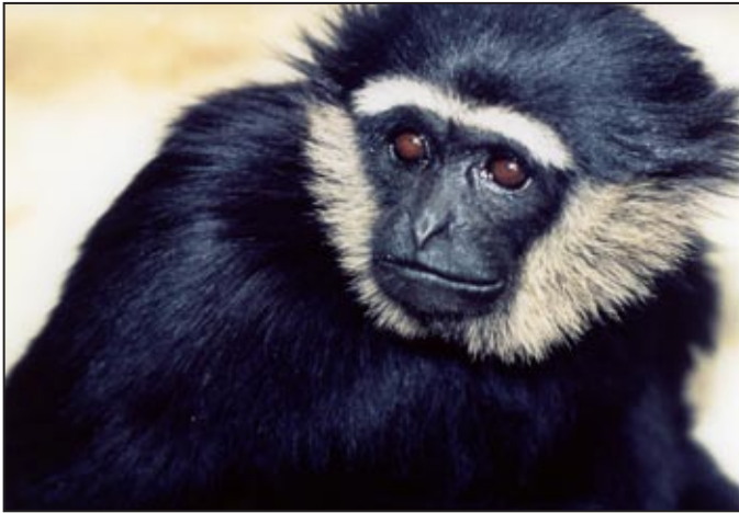
Figure 74. Hylobates agilis unko (lowland agile gibbon) adult male “Homer”, GCC.