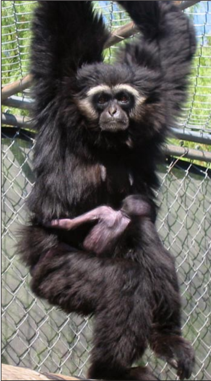
Figure 70. Hylobates a. agilis (mountain agile gibbon) 12 year 4 month old female “Ruby Baby” and 6 day old male “Milton”, GCC.