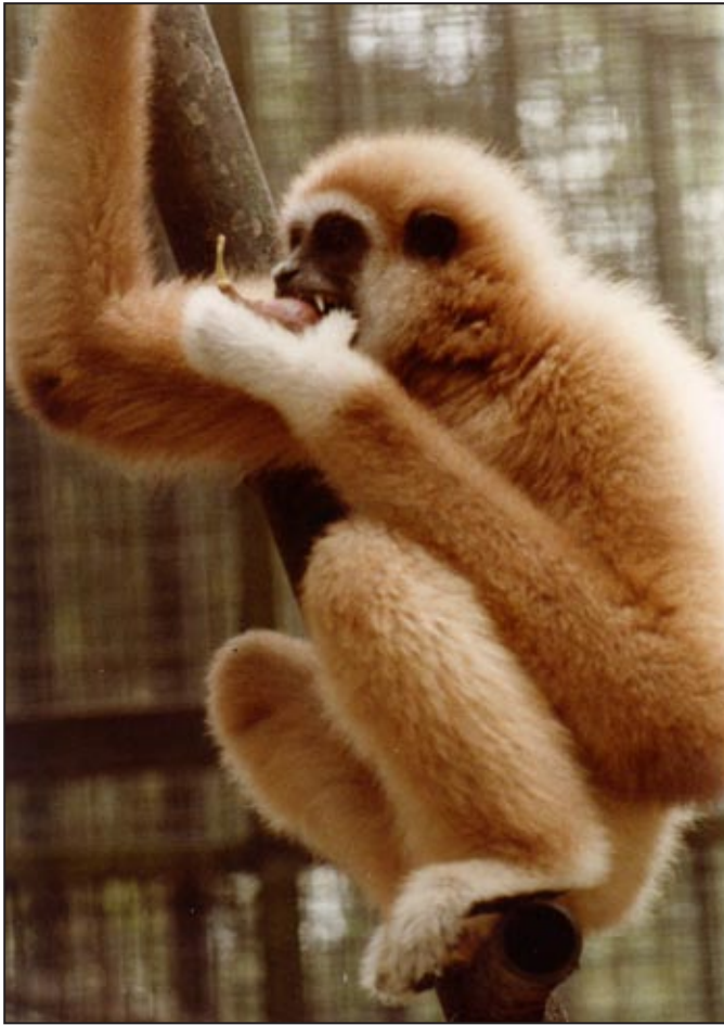
Figure 78. Hylobates l. lar (Malaysian lar gibbon) subadult male, Zoo Negara, Malaysia.