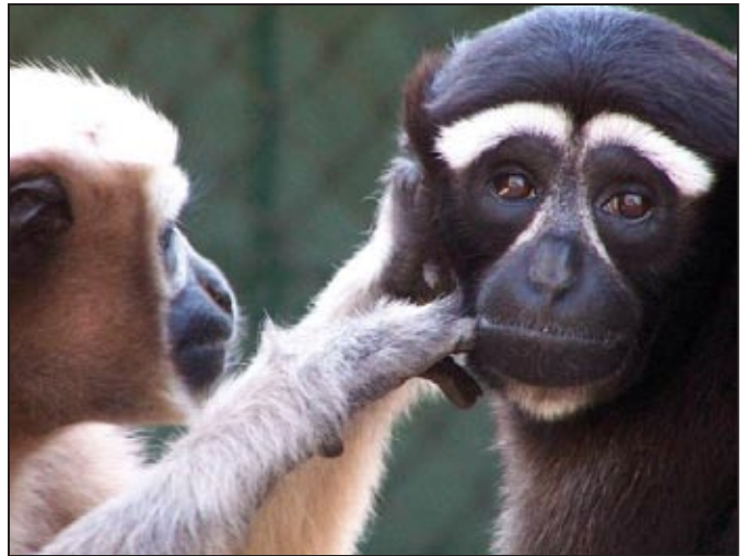
Figure 44. Hoolock leuconedys (eastern hoolock) adult male “Arthur” and adult female “Betty”, GCC.