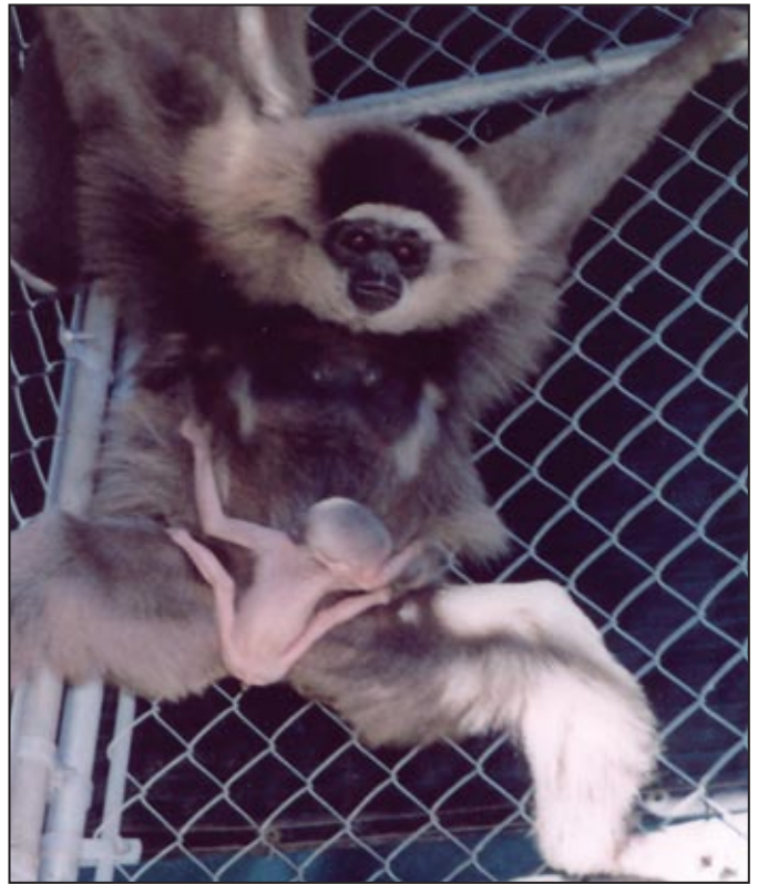
Figure 59. Hylobates moloch (Javan gibbon) adult female “Chloe”, 1 day old male “Lionel”, GCC.