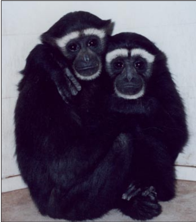
Figure 46. Hoolock leuconedys (eastern hoolock) juvenile female left “Drew”, juvenile male right “Chester”, GCC.